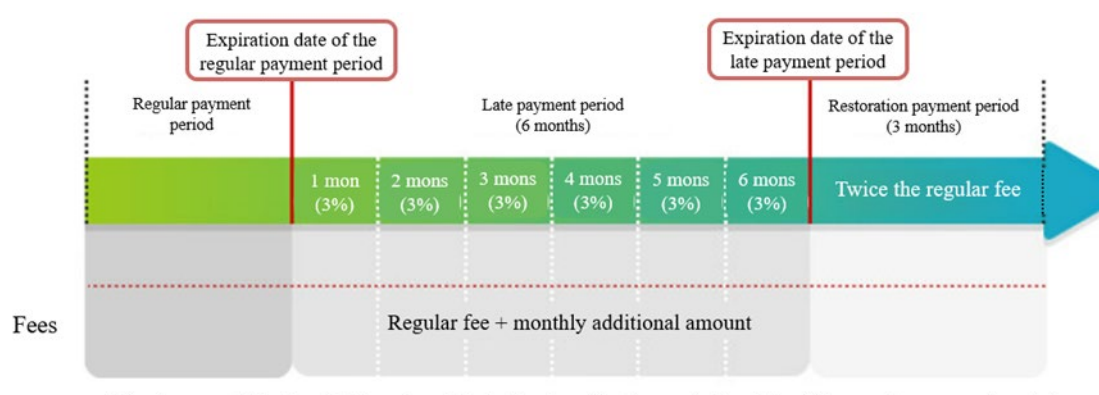
*The day on which the right is extinguished: the day after the expiration date of the regular payment period